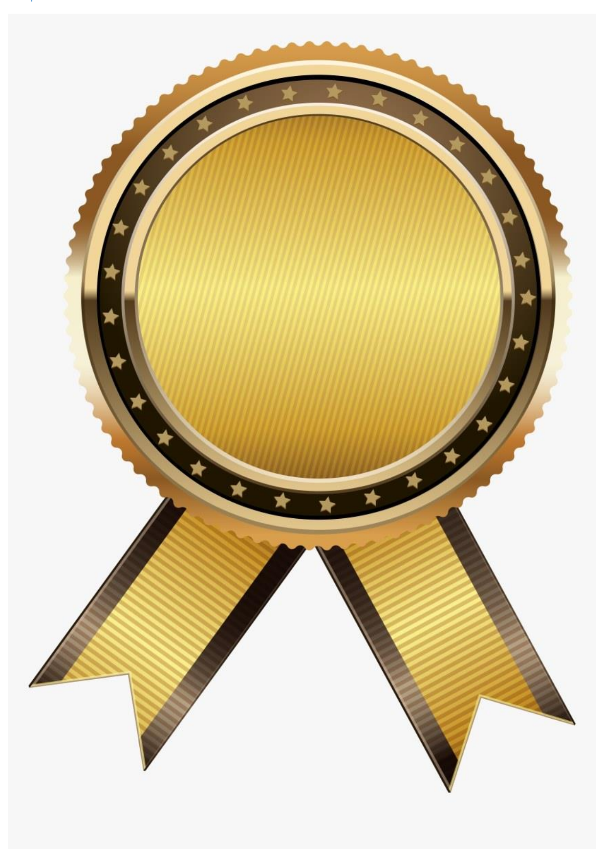
Pupils of the Month October